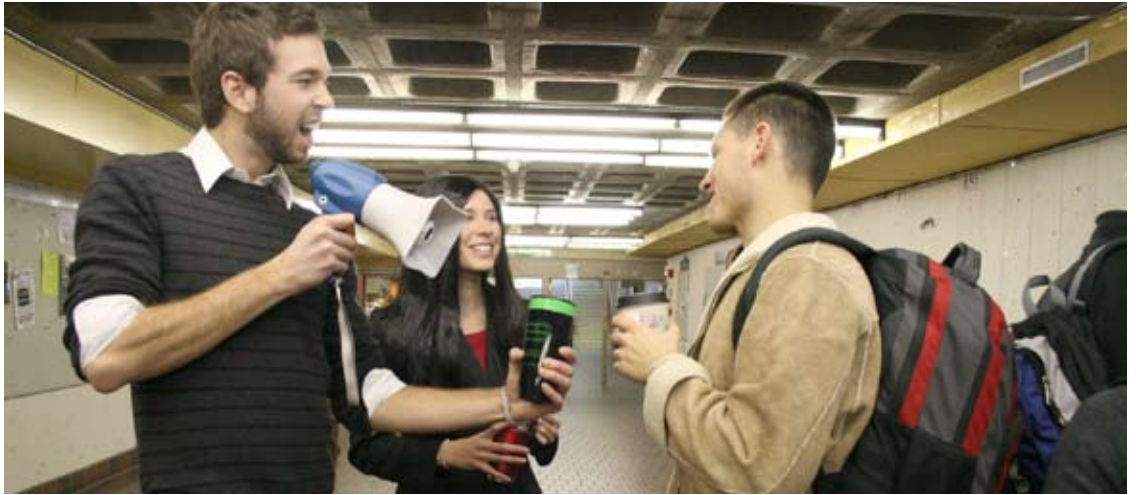
A student with a paper coffee cup is 'mugged' in the Arts tunnel.