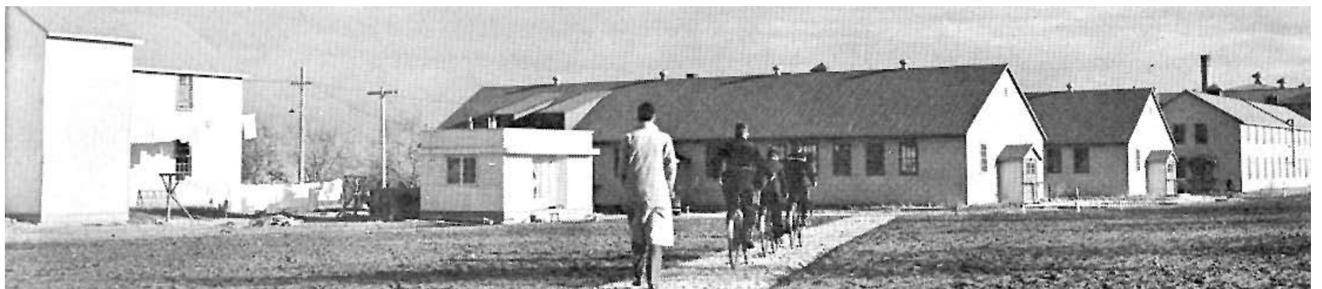
Armed Forces Community Apartments, U of S Archives Photograph Collection, A-3831

In 1941, the Canadian government implemented the Post-Discharge Re-Establishment Order as a program to help returning soldiers integrate back into the general population. It was hoped that the chaotic discharge at the end of the First World War could