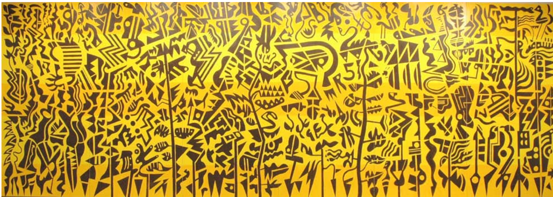
UNIVERSITY ART COLLECTION IMAGE