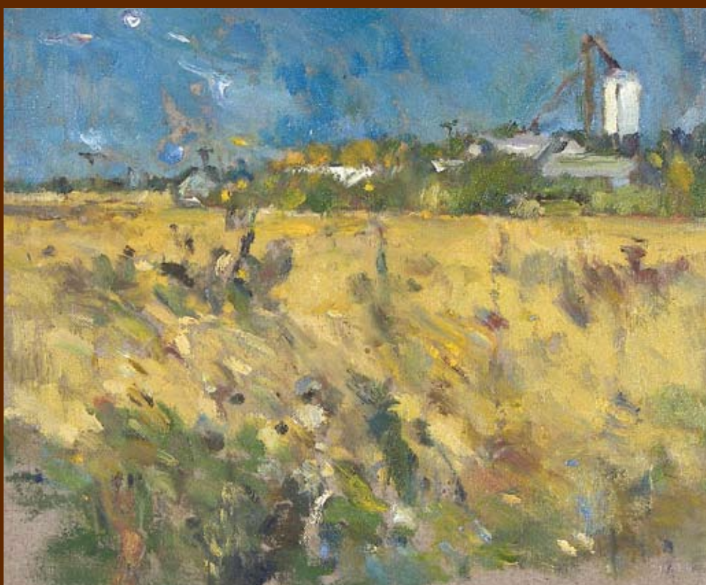
Clint Hunker, "Aberdeen Picturebook: White Tower and New Construction", 2008, Oil on Linen, 10" x 12"