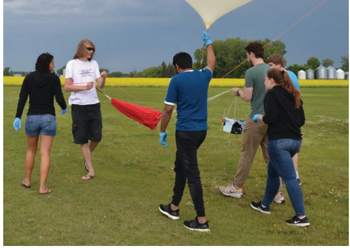
University of Saskatchewan graduate students were part of an international team that launched a research balloon 30 kilometres into near-space on July 24 near Saskatoon.

"This program gives a special opportunity to the students involved in rocket science at the university, and they are often among the top students at the university," she said. "It's so fabulous to be able to give these students a chance to do