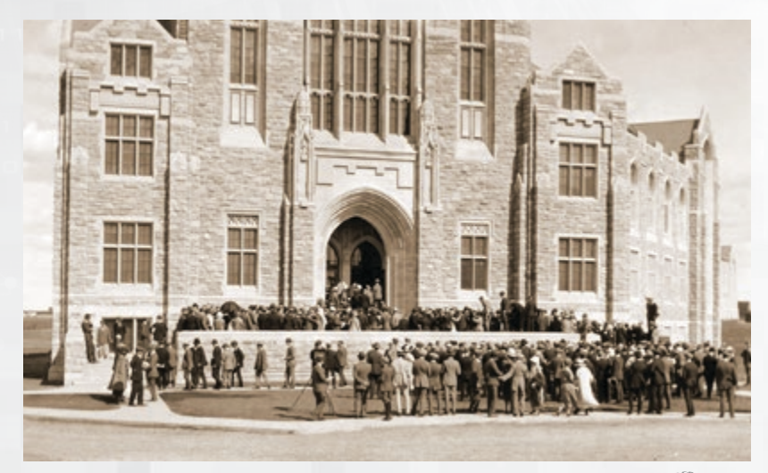
A large crowd gathers for the official opening ceremony of the Chemistry Building (later renamed the Thorvaldson Building) at the University of Saskatchewan on August, 22, 1924.