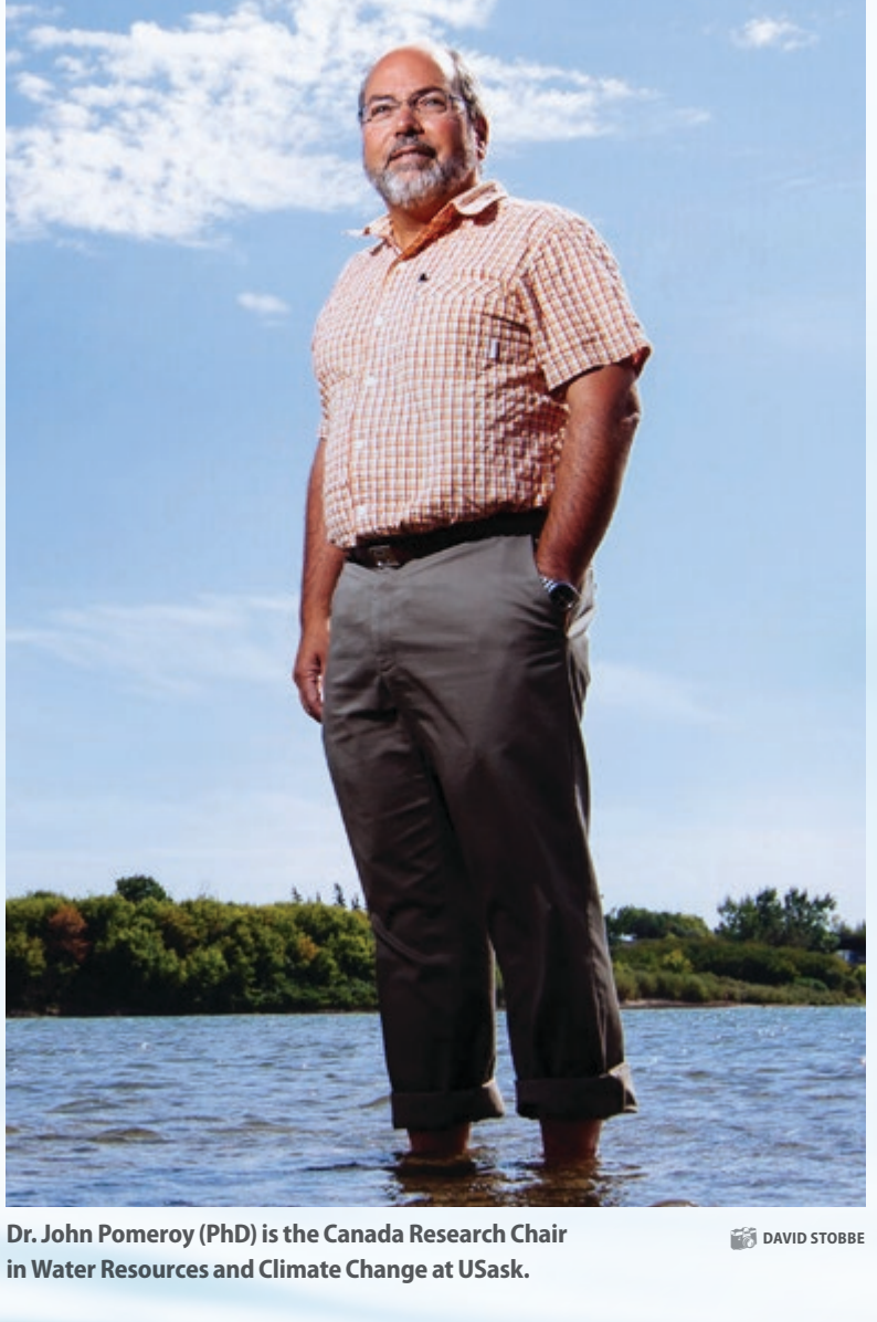
in Water Resources and Climate Change at USask.

GWF scientists are meeting with officials in Ottawa to recommend changes to the Canada Water Act, which was written in 1970. It doesn't recognize Indigenous governments, nor does it address the impacts of