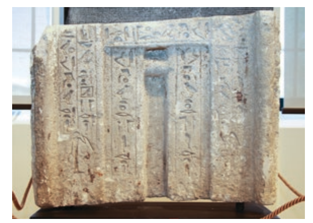
The 4,000-year-old Egyptian false door is one of the featured items in USask's Museum of Antiquities collection.