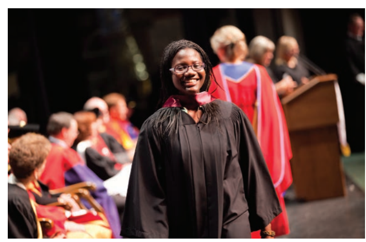
Academic advising is key to students reaching their academic goals