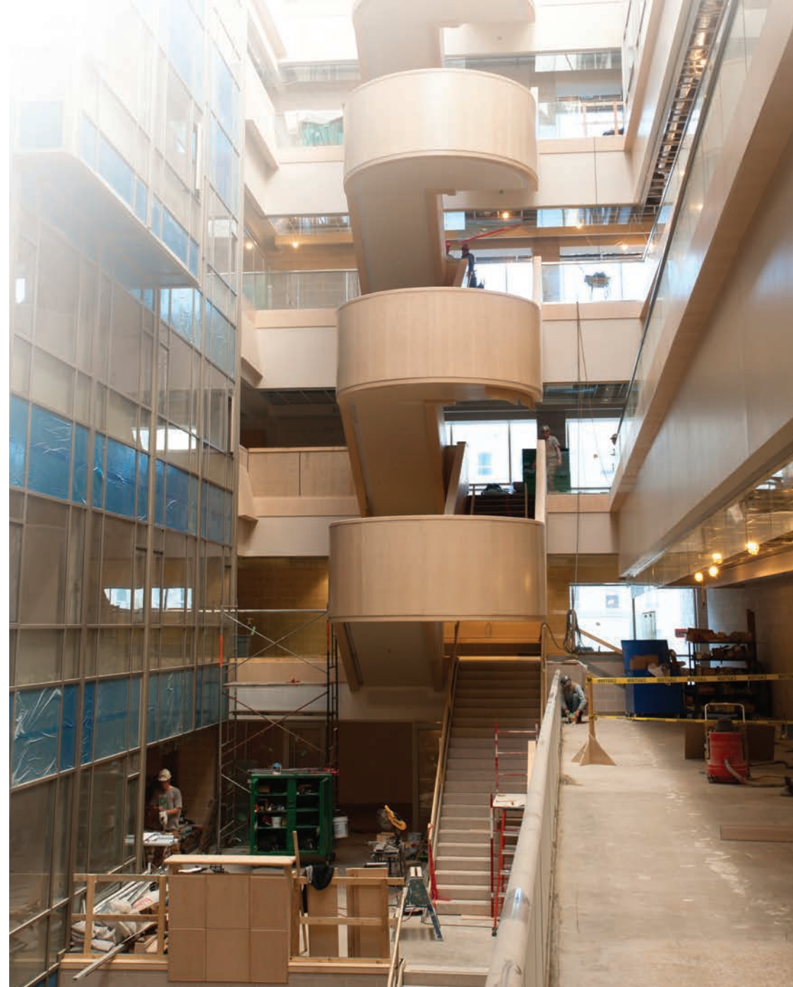
The finishing touches are being put on the D Wing atrium

"We've clustered them by like types of research—cancer, molecular design, neuroscience, drug discovery and others," said Steeves. "The clusters were dynamic for a while as we've tried to get the right people together" and in the end, there are about eight groupings of six to 10 researchers each. When grad students and lab staff are included, "we're talking about 300-400 people on the move."