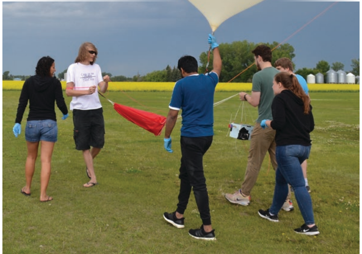
University of Saskatchewan graduate students were part of an international team that launched a research balloon 30 kilometres into near-space on July 24 near Saskatoon.

"This program gives a special opportunity to the students involved in rocket science at the university, and they are often among the top students at the university," she said. "It's so fabulous to be able to give these students a chance to do