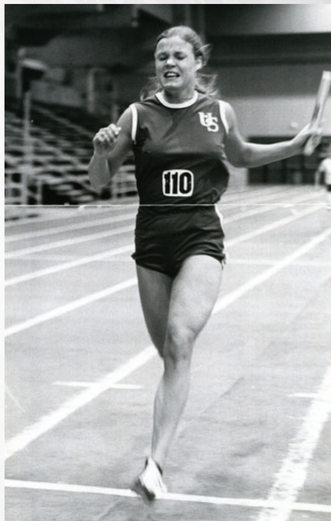
Diane Jones crosses the finish line in a relay race for the Huskies track and field team in 1975.

Jones Konihowski, who married former CFL receiver John Konihowski in 1977, graduated from the University of Saskatchewan with a Bachelor of Education in 1975, was awarded an honorary Doctor of Laws in 2002, and was named to the Huskie Athletics Board of Trustees in 2016.