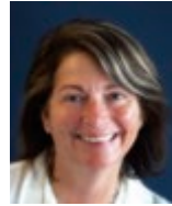
NATHALIE JOHNSTONE EDWARDS SCHOOL OF BUSINESS