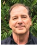
TIM MOLNAR COLLEGE OF EDUCATION