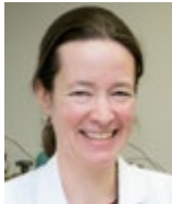
HELEN BAULCH GLOBAL INSTITUTE FOR WATER SECURITY, AND SCHOOL OF ENVIRONMENT AND SUSTAINABILITY