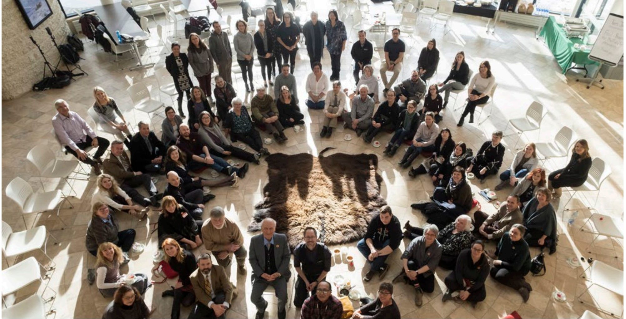
Elders and other members of the Indigenous community and Buffalo Circle Campaign participants join together in the Gordon Oakes Red Bear Student Centre at USask.