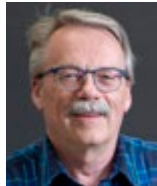
WILLIAM ROBERTSON COLLEGE OF ARTS AND SCIENCE (ENGLISH), AND COLLEGE OF EDUCATION (ITEP)