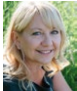
VICKI SQUIRES COLLEGE OF EDUCATION