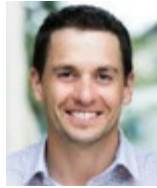
ROB WOODS COLLEGE OF MEDICINE