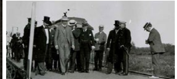
Clockwise from left: Prime Minister John Diefenbaker hands in his ballot after voting in Prince Albert in 1958.