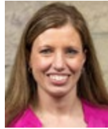
CHARITY EVANS COLLEGE OF PHARMACY AND NUTRITION