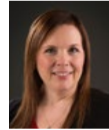
TRACIE RISLING COLLEGE OF NURSING