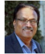
RAJ SRINIVASAN COLLEGE OF ARTS AND SCIENCE (MATHEMATICS AND STATISTICS)