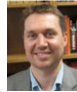
CLAYTON BANGSUND COLLEGE OF LAW