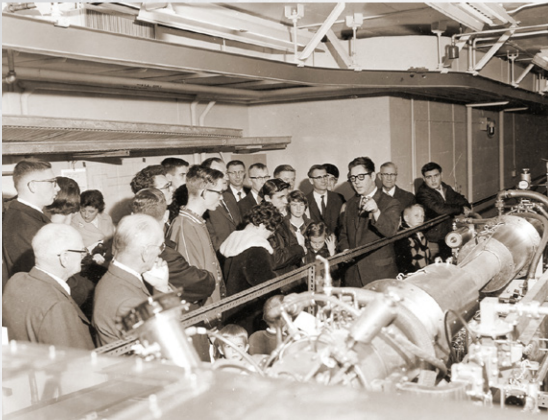
A crowd of people stand beside the University of Saskatchewan's new linear accelerator during the open house at the official opening of the facility on campus back in 1964.

Poole Construction of Saskatoon was the general contractor for the project, while California company Varian Associates designed and built the linear accelerator.