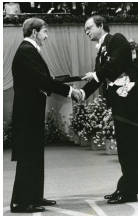
Dr. Henry Taube (PhD) receives his Nobel Prize medal from King Carl XVI Gustaf (right) of Sweden.