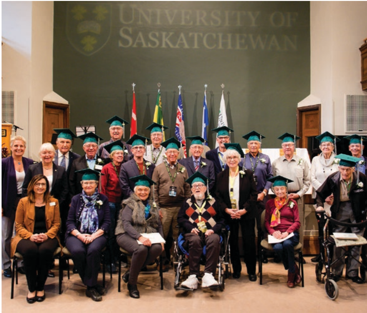
The Golden Grads ceremony was one of the highlights of the 2018 Alumni Weekend at USask.