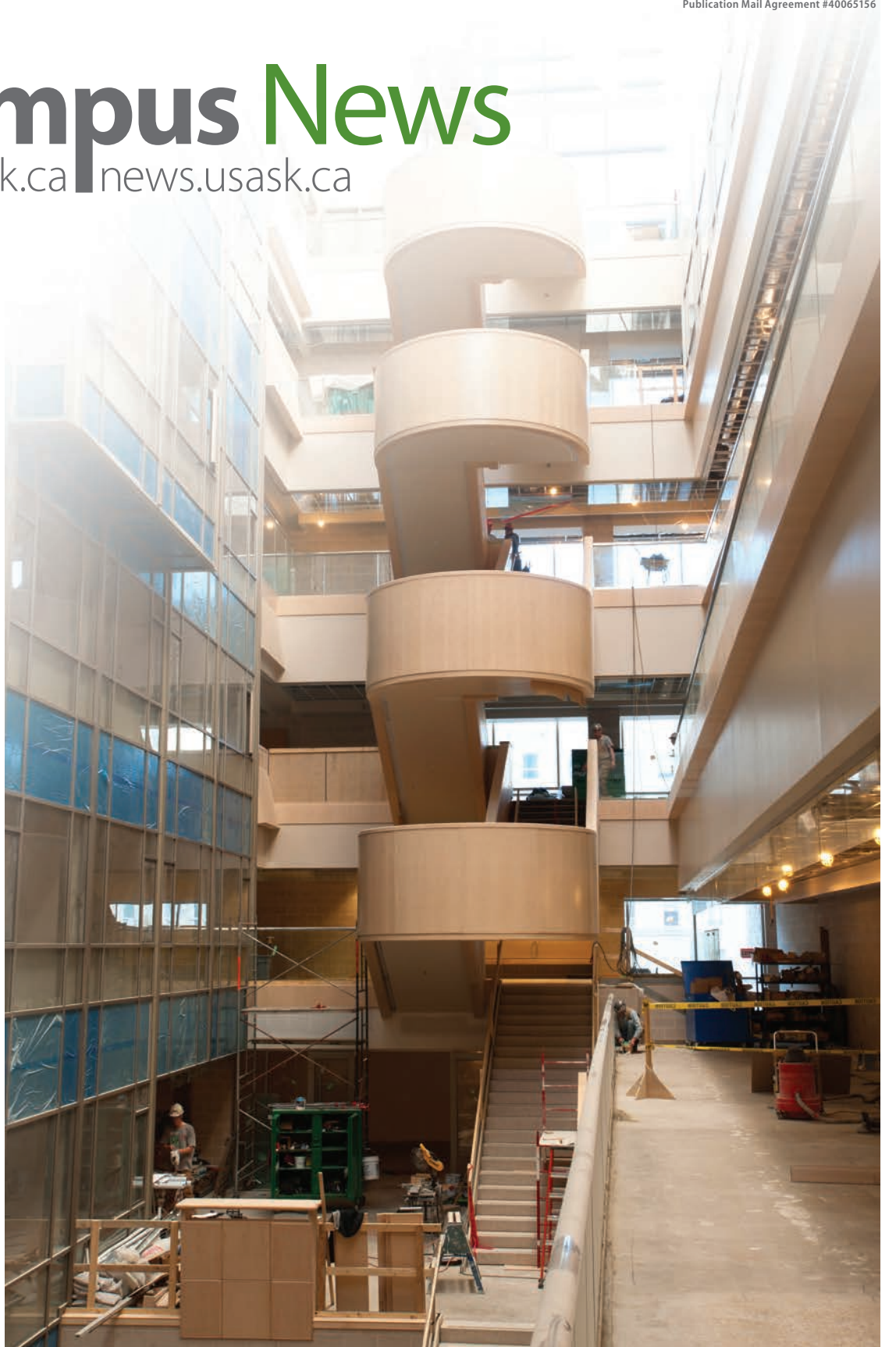
See Building, Page 2

“We’ve clustered them by like types of research—cancer, molecular design, neuroscience, drug discovery and others,” said Steeves. “The clusters were dynamic for a while as we’ve tried to get the right people together” and in the end, there are about eight groupings of six to 10 researchers each. When grad students and lab staff are included, “we’re talking about 300-400 people on the move.”