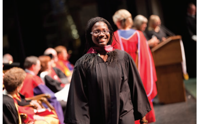
Academic advising is key to students reaching their academic goals