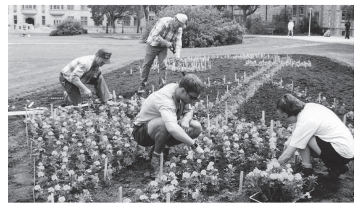
✓ PATRICK HAYES, U OF S ARCHIVES