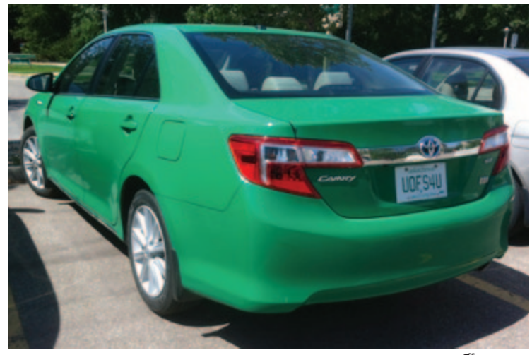
llene Busch-Vishniac's U of S green car

Another Saskatchewan winter is looming on the weather horizon. Have you figured out how to get from your office to the Starbucks in the Library without setting foot outdoors? I haven't done that yet but once