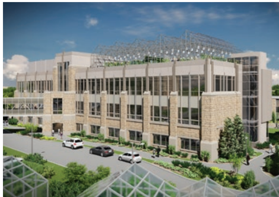
A rendering of the Collaborative Science Research Building.

The U of S received $30.1 million from the federal Post-Secondary Institutions Strategic Investment Fund for construction of the new research facility—matched by $33 million from the university's capital renewal and maintenance funds. ■