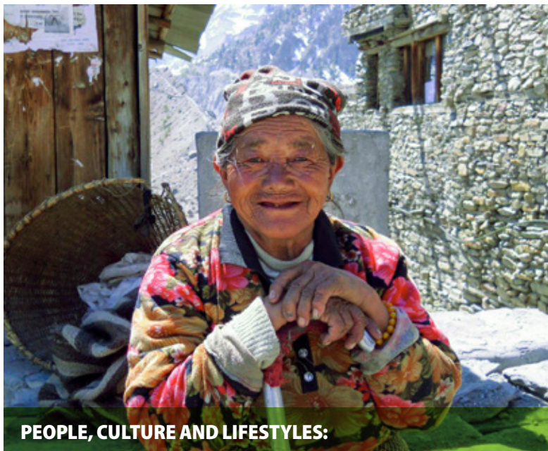
PEOPLE, CULTURE AND LIFESTYLES:

In our May issue, look for the winners of the Images of Research competition.