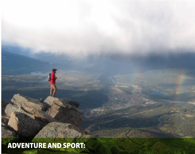
ADVENTURE AND SPORT:

(To view runners-up and honourable mention images, visit the U of S Flickr page at: flickr.com/photos/usask )