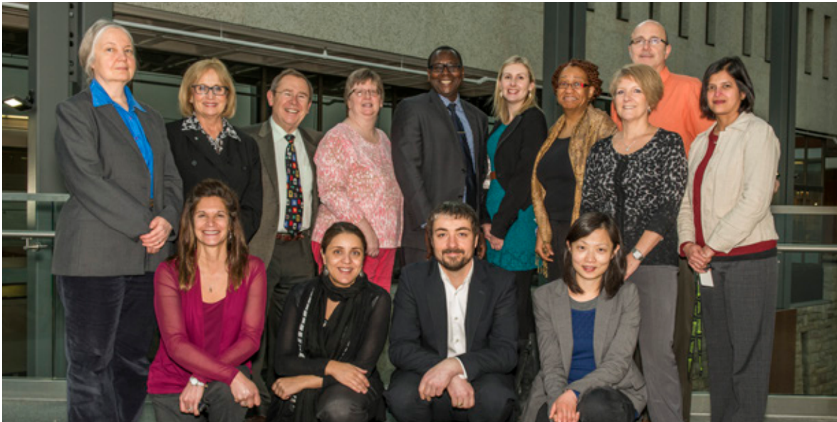
Faculty and staff of the School of Public Health, located in the Health Sciences Building.