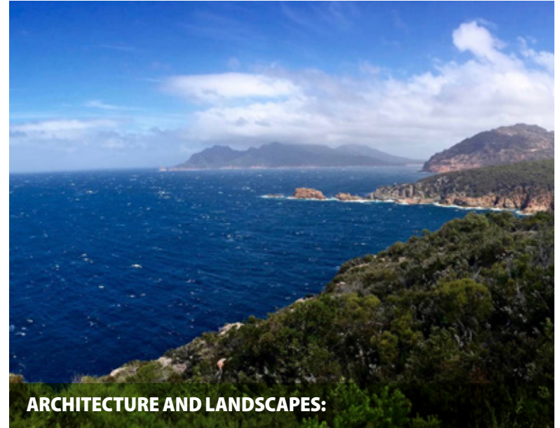
ARCHITECTURE AND LANDSCAPES:

The opportunity to further my study in Canada not only allowed me to experience quality education but also allowed me to explore this beautiful country. Canada's well-kept nature and astonishing landscapes are waiting to be discovered. With numerous world-class National Parks, some recognized as UNESCO World Heritage Sites, this is heaven for a nature lover and avid hiker like me. One of my favorites is Jasper National Park. This picture was taken at the summit of Whistler Mountain. The view is just amazing!