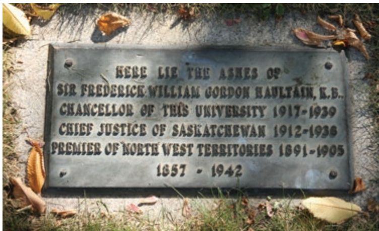
Sir Frederick William Gordon Haultain's ashes rest near the Memorial Gates.