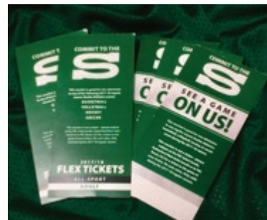
JAMES SHEWAGA , news editor

Some people might shy away from wearing the same thing twice. But not you when it comes to finding this sweater under your tree. With a slight oversized fit and dropped shoulder, finished with a ribbed-knit detailing around the neck and cuffs, prepare for this classic vintage jumper to be the object of many obsessions this holiday season. Is it possible for something to be so simple, yet so great at the same time? This sweater can be purchased at the Shop usask Bookstore.